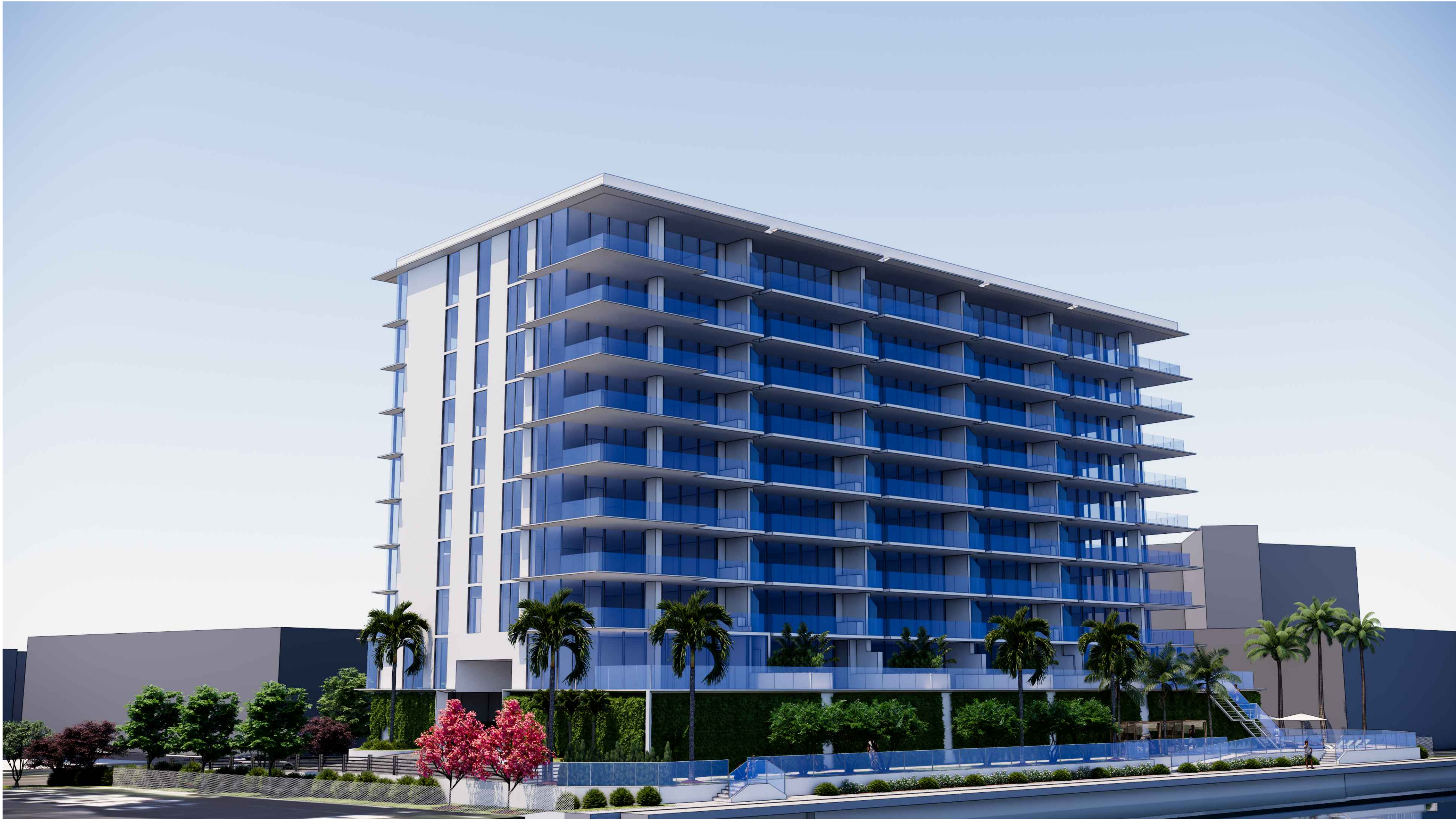
View from North-West Corner, looking South-East